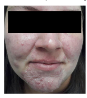
Fig. 3. Clinical improvement at 30 week of gestation

This therapeutic regimen led to a significant improvement after 10 days. Corticotherapy was slowly reduced at 2 mg twice a week till 28 weeks of gestation and the topical treatment consisting in benzoyl peroxide cream 4%, ichthyol pale and zinc oxide, also dermatocosmetic cleansers was continued as a maintenance treatment. By the time of 30 weeks of gestation, the patient showed a significant decrease of inflammatory lesions (fig. 3).